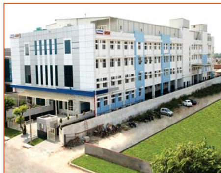
Stainless Steel Wires