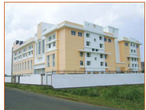
Hardfacing FCAW, Wear Plates, MS wires